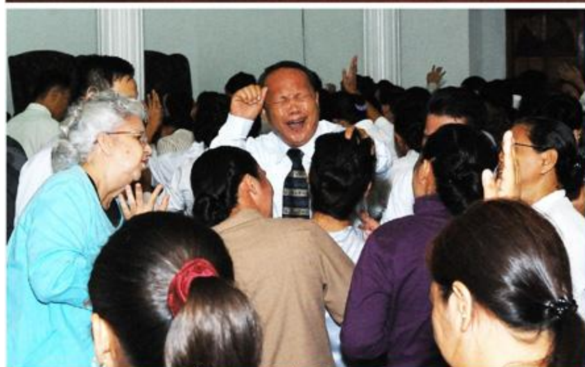
Altar service in Conference.