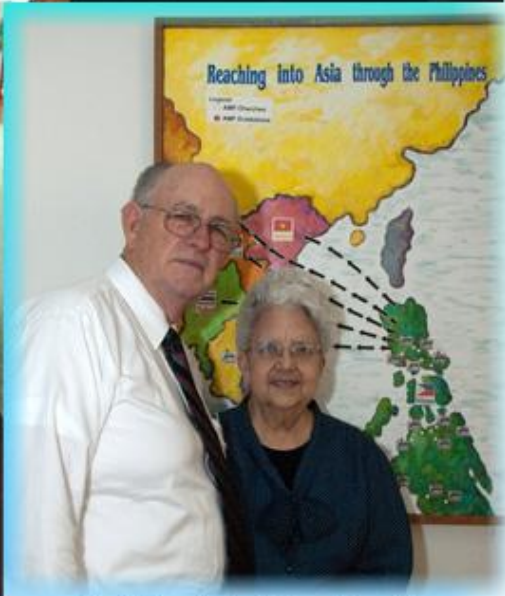
The Wheeler's vision..Reaching...