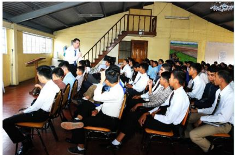
Bro. Short preaching to the youth.