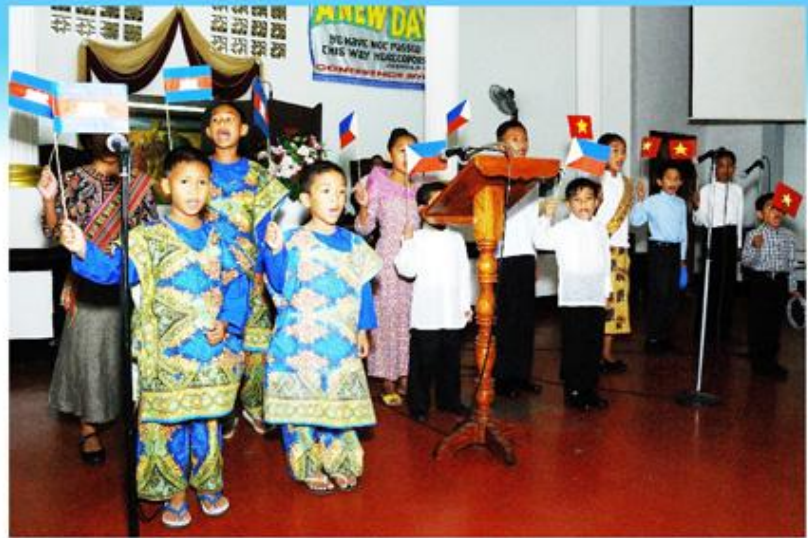
Children from Calamba singing in Tagalog, Vietnamese, Khmer & English