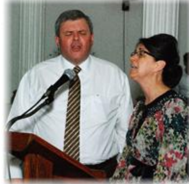
The Bullocks singing at graduation.