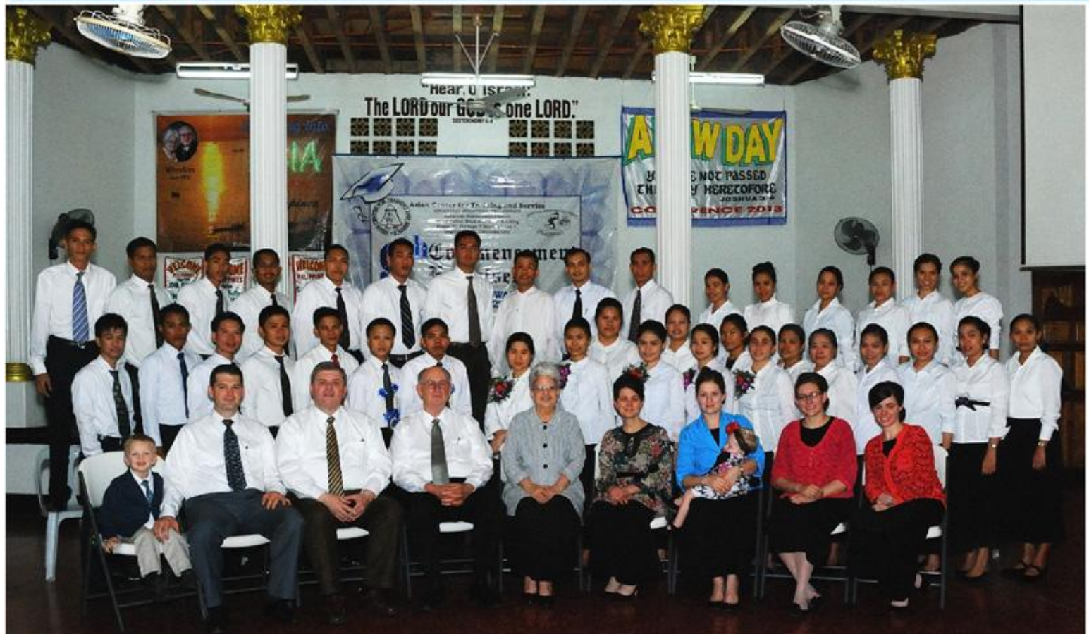
ACTS graduates and alumni. Seated on the front row - from left to right